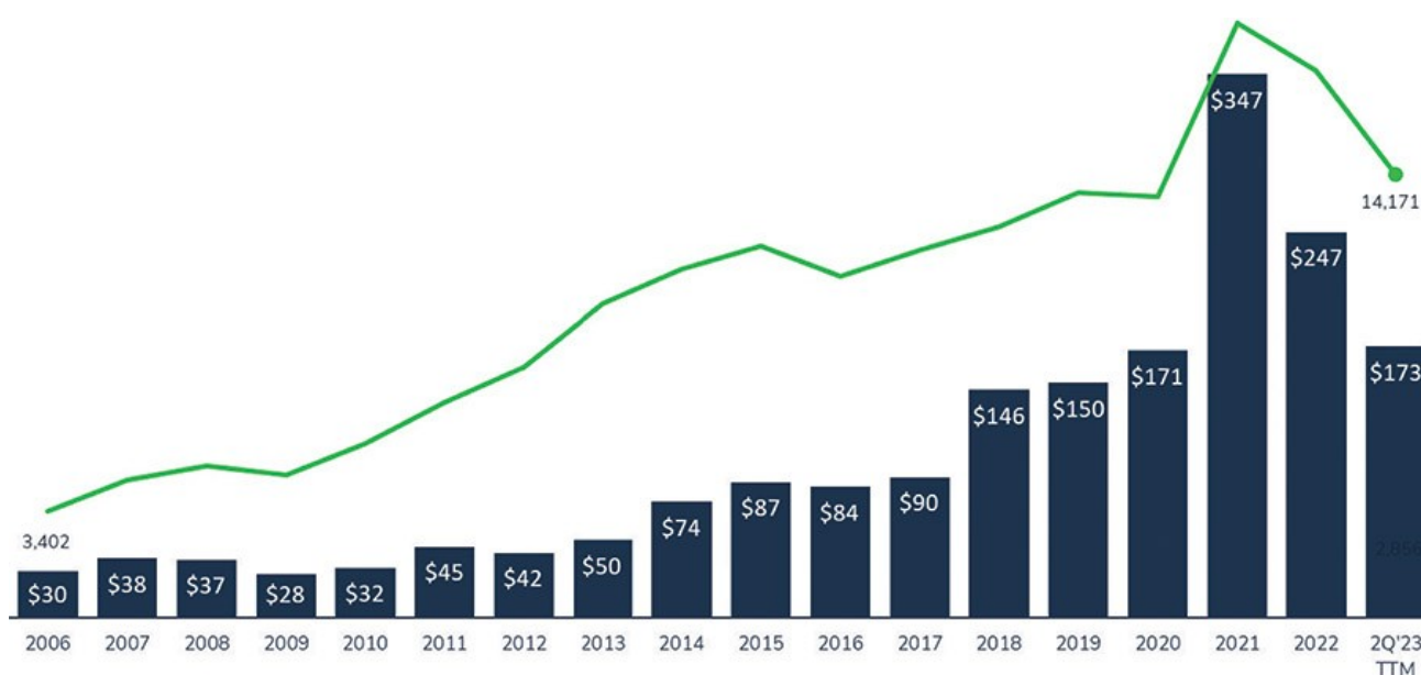
Annual Venture Capital Activity — Deal Volume ($ in billions) and Deal Count